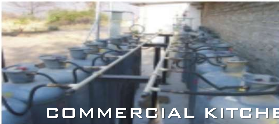
COMMERCIAL KITCHEN INSTALLATION